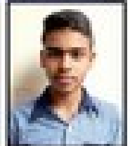
Yagik (XI) 2nd (U-17)

"Let the Racket do the talking" Badminton is a Racket sport often played as a casual outdoor activity. It may be conducted in singles or doubles where the player plays using Rackets to hit a shuttle across a net. This game is a great work of concentration and will power. Redians too displayed their strength when the students participated in "District level Badminton Competition". Here we stand with pride as our children outperformed all and grabbed different medals at different levels.