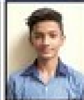
Krrish (XI) 2nd (U-17)