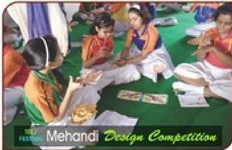
TEEJ FESTIVAL Mehandi Design Competition