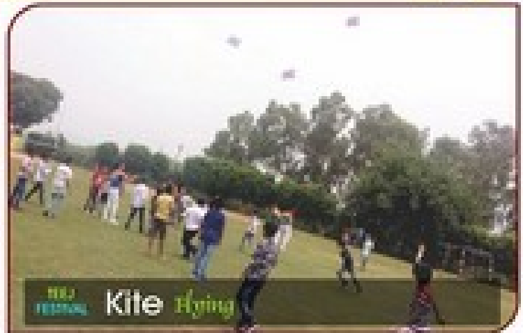
TEEJ FESTIVAL Kite Flying

Teej is the main festival of Haryana. It is celebrated in the month of August. On this day people fly kites & enjoy for the whole day. R.E.D. school, Jhajjar also celebrated it with great pomp & show. Different activities were conducted for the students of classes Nur-X. There was a Mehandi competition for girls for classes VI to X. Girls were very excited to apply mehendi on each others hands. For classes III to VIII Kite Decoration competition was organised for Boys. Participants took an initiative & did their best. Students decorated their kites with beads, mirror etc. Nursery to 2nd class students flew kites and danced on this occasion. Small kids were very excited & happy to do this activity. It was a wonderful display of our culture and tradition.